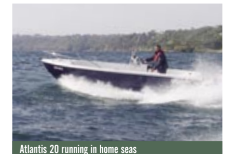
Atlantis 20 running in home seas

To do this fully aware that the boat might not be perceived as 'modern, desirable or trendy' is a huge compliment