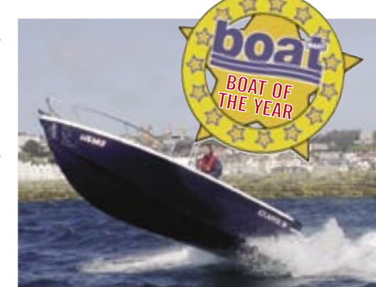
The Atlantis 100m outside the harbour - calm it's not!

With apologies to unmentioned advertisers, here's my own personal pick of 2005's tests.